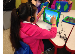
A student in a kindergarten classroom at the Cesar E. Chavez Multicultural Academic Center in Chicago uses a tablet to learn letters of the alphabet through sound.

Under the blended learning model and the extended learning day, the Cesar E. Chavez